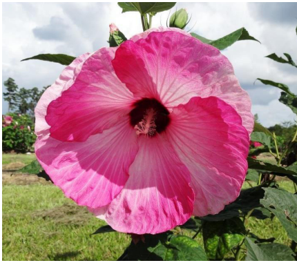
Strawberry Swirl Hibiscus