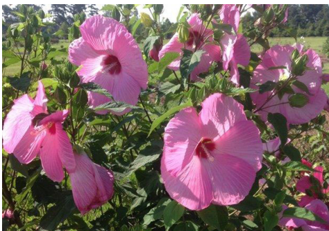
Pink Elephant Hibiscus