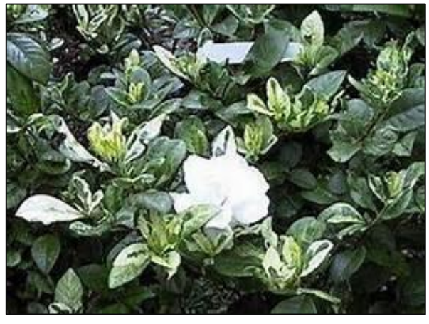
7. Gardenia jasminoides 'Variegata' RUBIACEAE (Variegated Gardenia) - Evergreen shrub with glossy, cream-yellow, variegated foliage. Produces fragrant white flowers from spring to summer. Grows 4-5' x 3-4'. Prefers part sun. Propagated by cuttings.