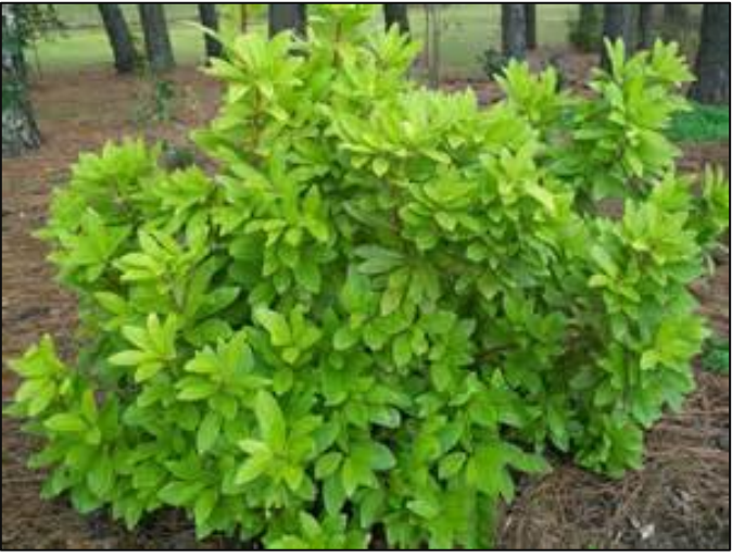
8. Illicium parviflorum 'Florida Sunshine' ILLICIACEAE (Florida Sunshine Anise) - Vigorous dense shrub producing anise-fragranced, chartreuse-gold foliage. Foliage color becomes brighter while the petioles/stems take on a scarlet-red coloration during winter. Grow in light shade. Grows 6-8' x 4-6'. Tolerates wet soils. Propagated by cuttings.