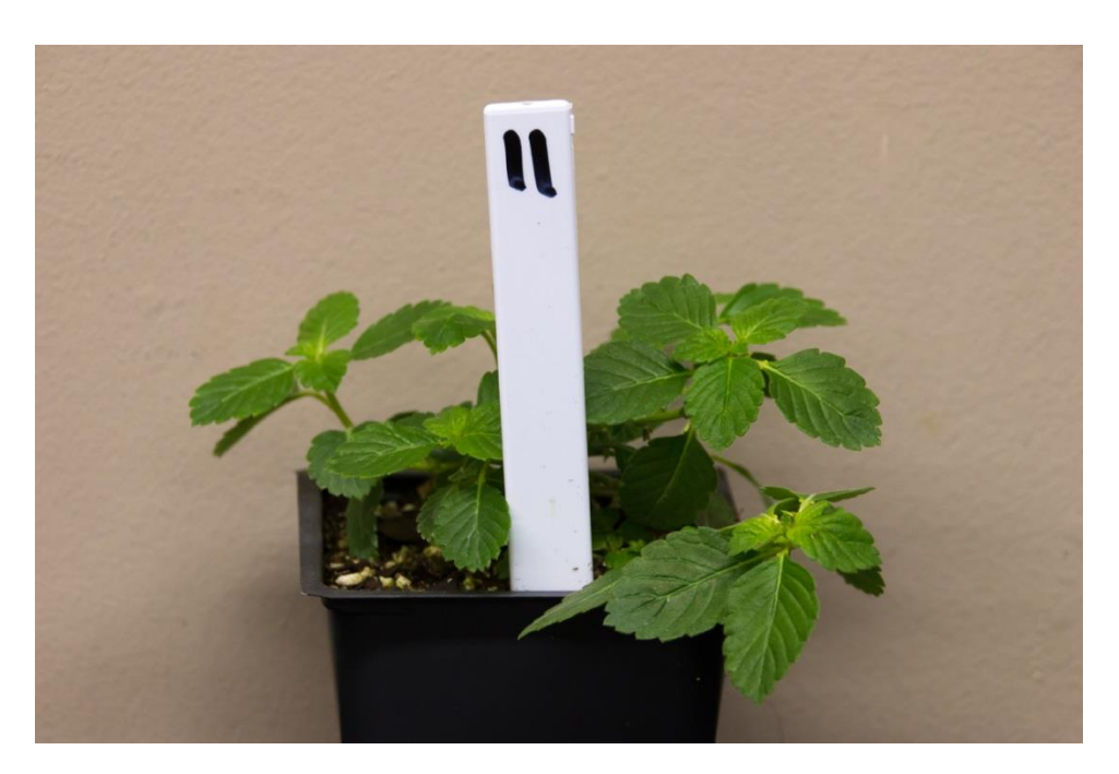
11. Turnera ulmifolia 'Trailing Yellow' TURNERACEAE (Creeping Buttercup) – Creeping form of yellow-flowering turnera with small, dark green foliage. Produces yellow flowers mid-spring through fall. Prefers part sun and protection from the afternoon sun. Prostrate growth habit. Average size 4" x 2'. Propagated by cuttings.