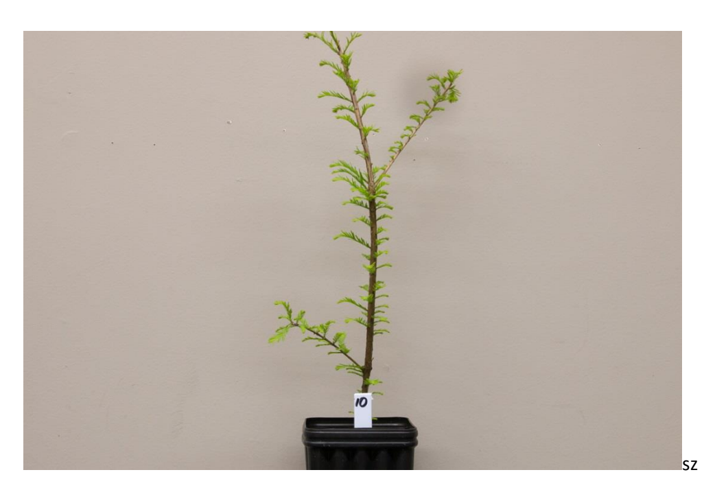
10. Taxodium x LaNana TAXODIACEAE (Hybrid Bald Cypress) – Cross of Montezuma Cypress and Bald Cypress selected for salt and alkalinity tolerance. Assets include good form, no knees and fast growth (5' – 6' per year). Foliage held on tree long into winter. Prefers full sun. A Stephen F. Austin Gardens advanced selection from the breeding program of the Nanjing Botanical Garden, Nanjing, China. Grows to 80+'.